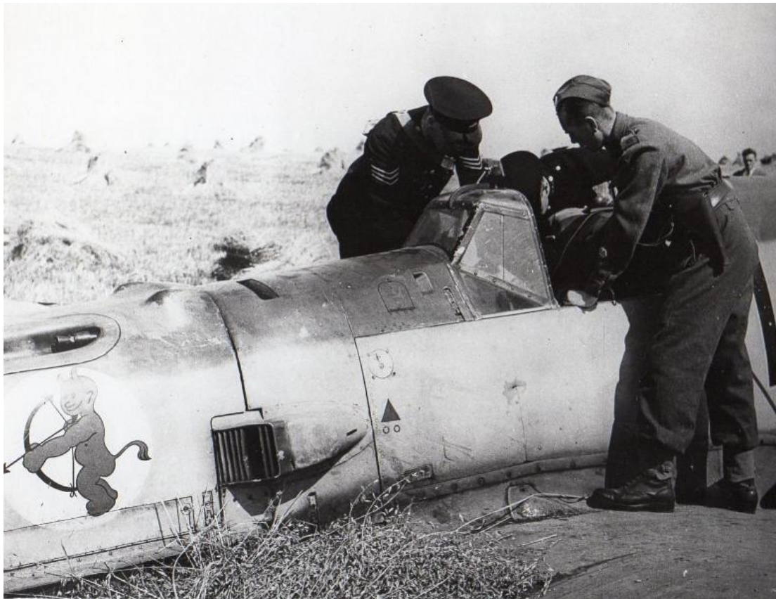
Close up of the cockpit area (Saunders).