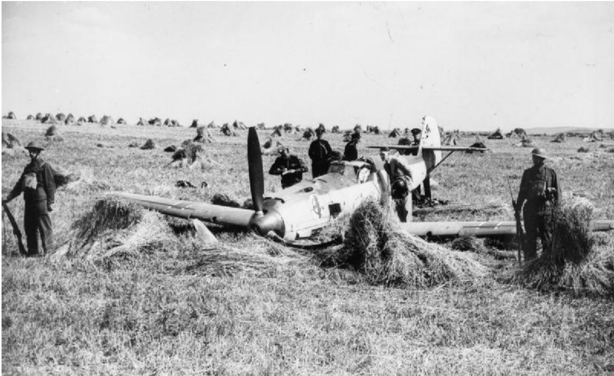
The "Red" 14 under close examination and guard after the forced landing.